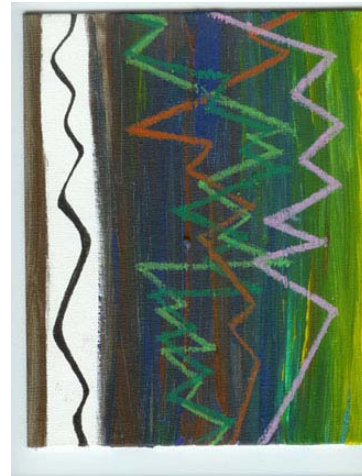
Image: Graph of Energy and Attitudes

the strength of her clear, smooth protected seed carries her through.